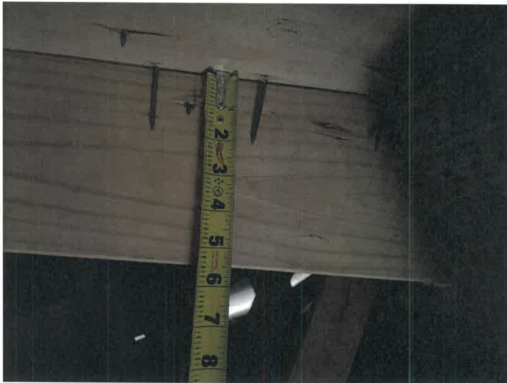
Figure 3 – Sheathing Fastener Size 8d Confirmed (Typical)