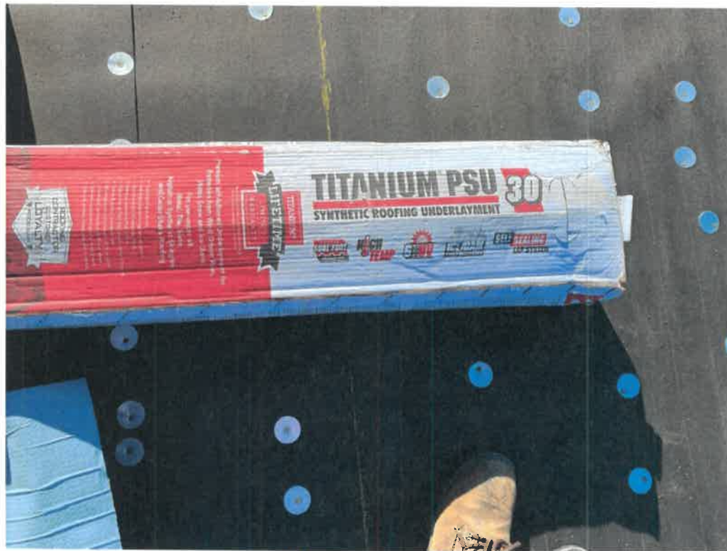
Figure 4 – Secondary Water Barrier at Sloped Section (Typical)