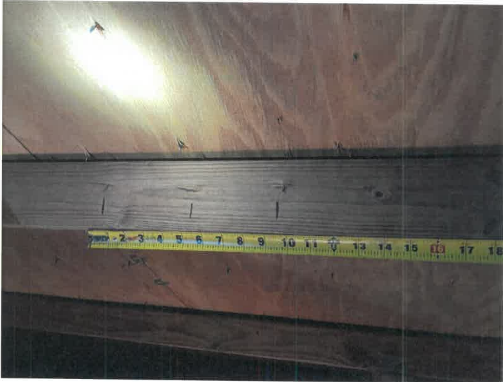
Figure 2 – Plywood Sheathing Fastener Spacing (Typical)