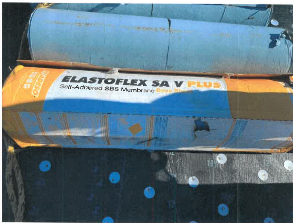
Figure 5 - Secondary Water Barrier at Flat Section (Typical)